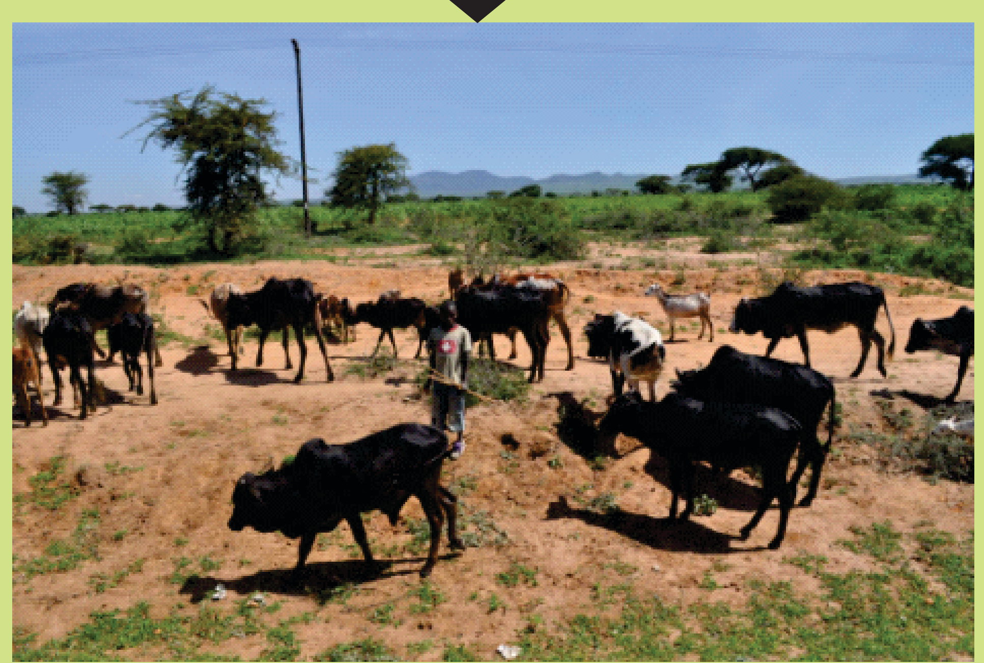
Benefits enhance resilience, productivity & profitability